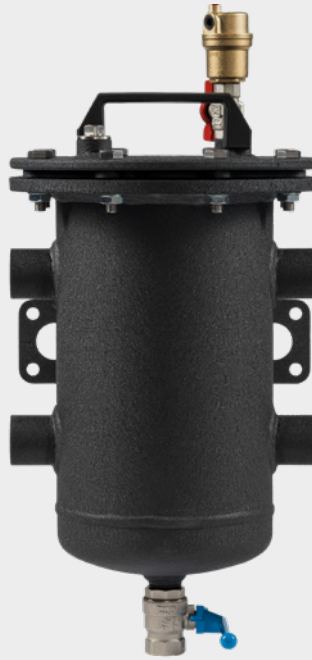
AVAILABLE INSTALLATION SETUPS:

The impurities blocked by the filter accumulate inside the basket. Cleaning starts by opening the designated discharge valve. In this way all the magnetic contaminants (ferrous residues) and non-magnetic (algae, sludge, sand...) in the system are removed.