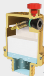
Valve position OPEN