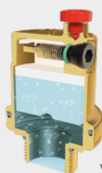
Valve position CLOSED

For the valve to properly operate, make sure that the water pressure remains lower than the maximum discharge pressure value.